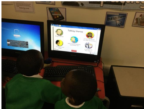
Using computer software to listen to stories.