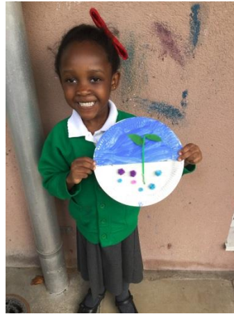
R.E. focus – learning about the story of Creation