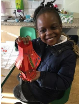
Making a chinese lantern