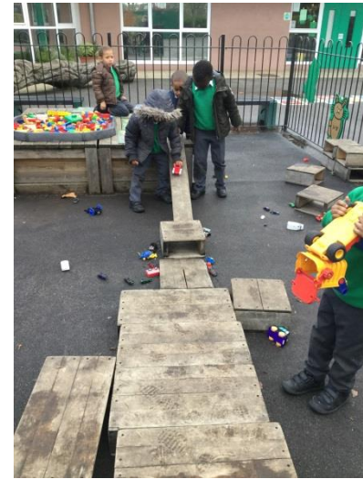
Building a ramp for cars to go down.