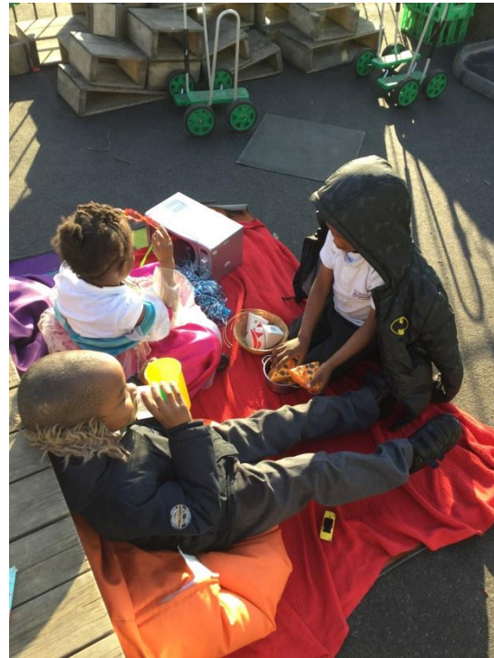
Having a picnic in the outdoor area.